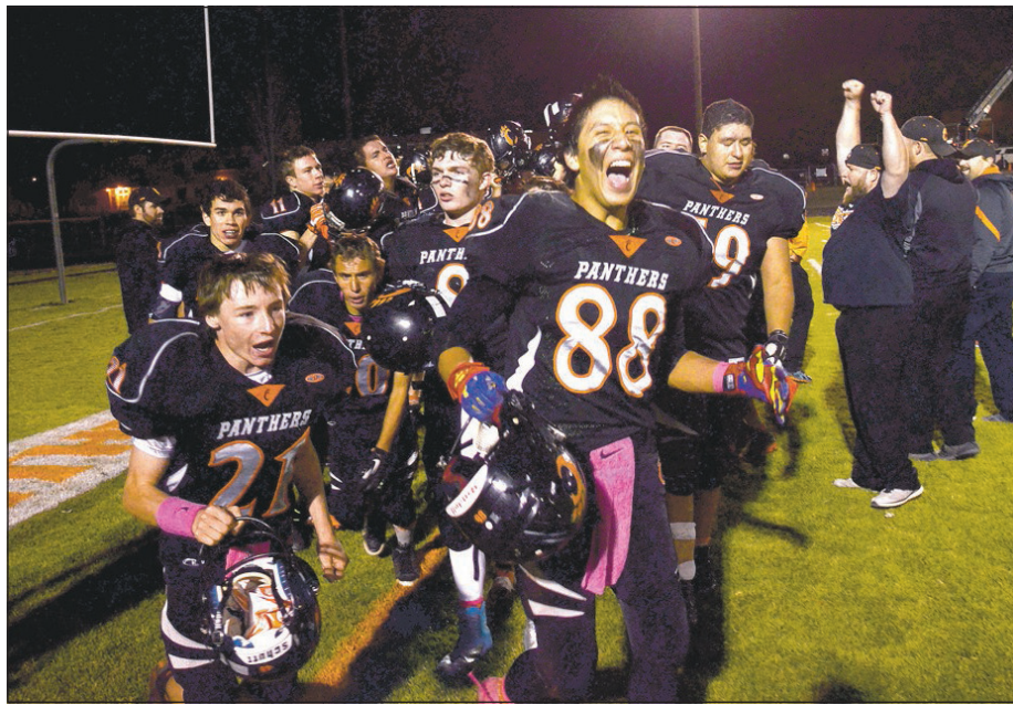
M-CHS celebrates after beating St. Mary's 40-37 in Round 1 of the Class 2A playoffs on Oct. 31.